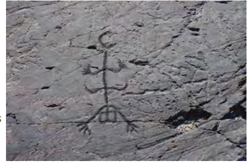
Digitally enhanced photograph Image of a seemingly four-armed anthropomorphic figure at Hawley Lake.