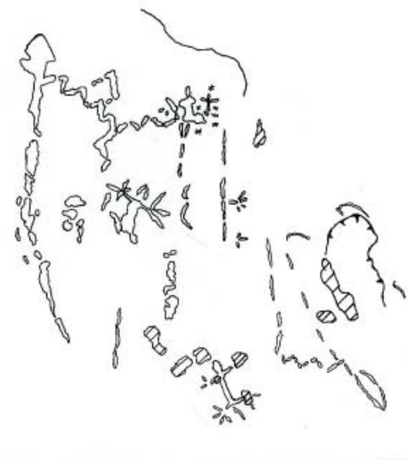
NRAF 2007 Panels 9A and 9B combined