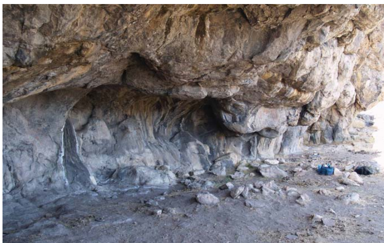
Interior of Serendipity Shelter

These archaeological investigations revealed that Serendipity Shelter was a multipurpose occupation site (illustrated by the presence of a midden, ground stone, debitage, stone tools, projectile points, food remains, and rock art) that has been used at least since the middle Holocene (illustrated by the presence of Elko, Eastgate, and Desert Side-notch points, and ceramics).