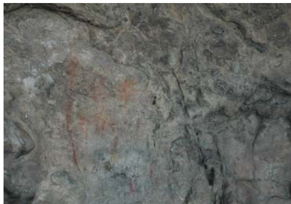
Faded pictograph at Serendipity Shelter (Panel 9A, NRAF 2007)

Currently, red is the most common pigment at Serendipity Shelter, but this does not necessarily mean that red pigment was always the predominant color at the site. The site's rock art appears to be deteriorating through time, most likely due to natural processes such as wind-driven sand abrasion, dust adherence, and water percolation. Elements that appeared to be well defined in 1982 and 1995 could only be identified as smudges in 2007. White elements seem to be the most susceptible to deterioration through time, followed by yellow, and then red. Although red elements lose detail and fade toward smudges over time, they do not seem to fade away as completely as do elements painted in other colors.