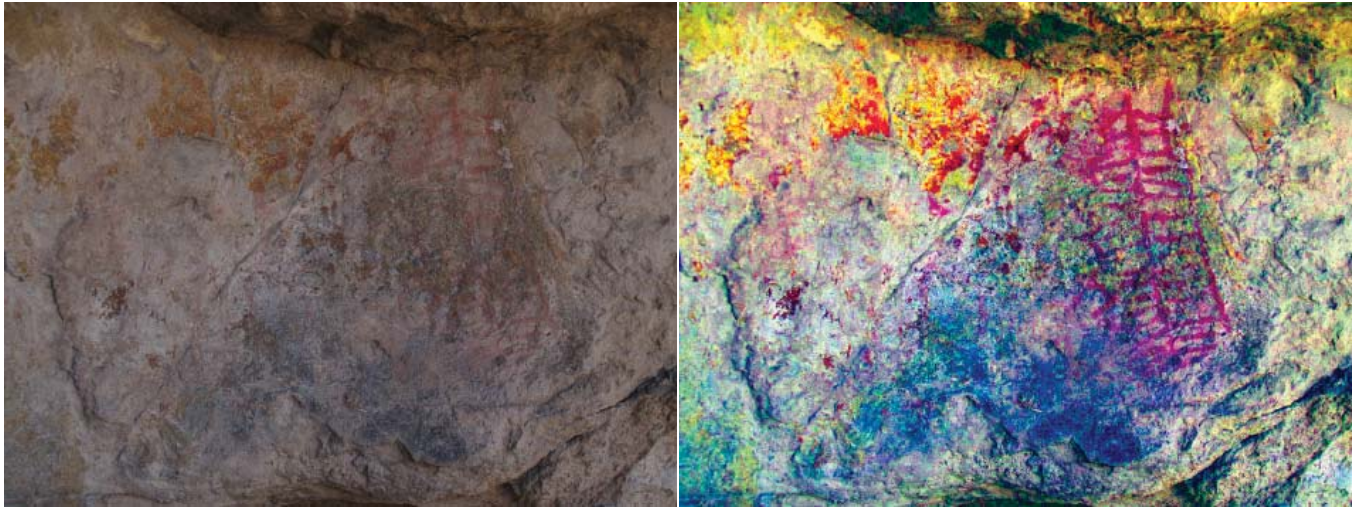
Rock art panel, before (left) and after (right) D-stretch enhancement