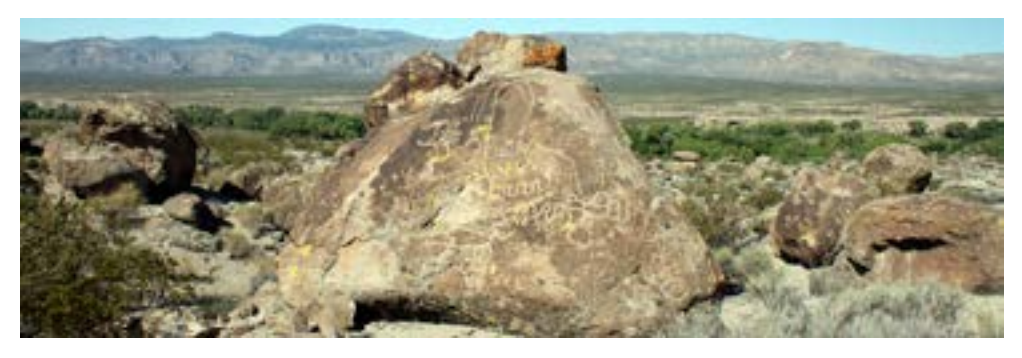
GBAC 2016's theme "Featured Landscapes" explores the role of landscape studies in explaining prehistoric cultural patterns

organizes the conference. "It has a national appeal...This is a friendly conference and everyone is welcome." The conference schedule includes multiple daily sessions of papers on Thursday and Friday; nightly open bar socials; a Friday evening banquet and awards ceremony, followed by dancing to live classic rock music by The Hammerstones; and Saturday field trips.