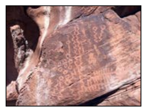
Basin and Range tradition curvilinear and rectilinear imagery

A range of zoomorphs is represented at Valley of Fire, including