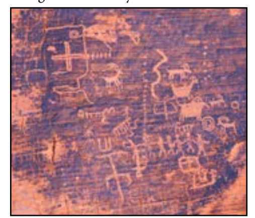
Panel with densely arranged rock art motifs

The main focus of NRAF's project was on sites in the Mouse's Tank area, a particularly popular attraction for visitors to the State Park. Rock art in this area forms dense concentrations and, along Mouse's Tank trail, is spatially extensive, extending 500 m along a narrow canyon. Smaller sites