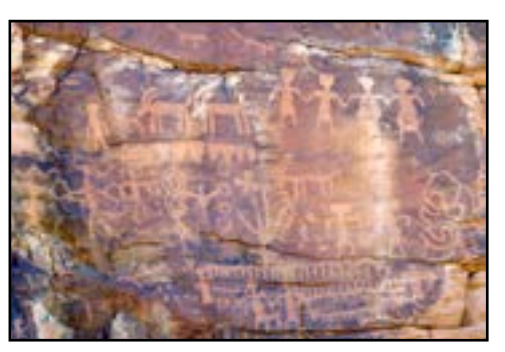
Anthropomorphs joined at the hands and other imagery

Another distinctive treatment is the repeated theme of four anthropomorphs joined at the hands. This is found at several places along Mouse's Tank Trail. This has been interpreted as depicting social cohesion either by participation in ceremonial practice or by symbolically asserting co-operative activities.