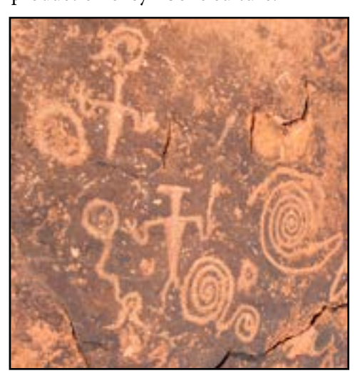
Curvilinear designs and anthropomorphs

Discernible differences in petroglyph patination and superimposition show that rock art at Valley of Fire was made over a long period. It is likely that the main periods of prehistoric use of the area identified by previous archaeological research were each accompanied by the production of symbolic culture.